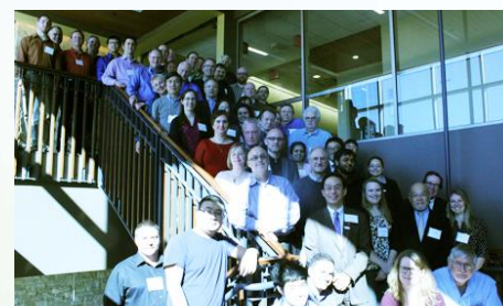
Poster session and attendees at 2017 Facilities Open house