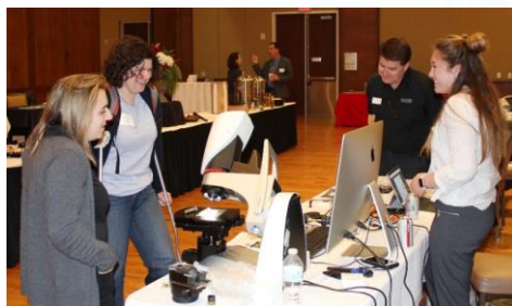
Student speaker (right) and attendees (above) at MRSEC Facilities Day Open House on April 12, 2018

The Wisconsin MRSEC's fourth annual Facilities Day Open House, held on April 12-13, 2018, engaged 165 scientists, engineers, students, instrument vendors, and employees of local companies. Day 1 featured tutorials by vendors of instrumentation, which were followed by presentations of MRSEC research that used the instrumentation. Day 2 focused on demonstrations of regionally unique instruments, including the MRSEC's atom probe and aberration-corrected scanning transmission electron microscope. MRSEC shared facilities are also being used for educational outreach to school-age students. For example, students and teachers at local schools have used the MRSEC's table-top scanning electron microscope to image microstructures such as the stoma of plants.